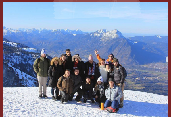
Spring '20 Salzburg Semester Cohort