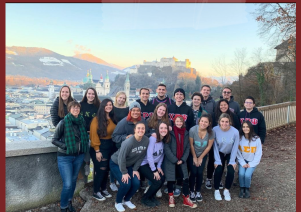
Fall '19 Salzburg Semester Cohort