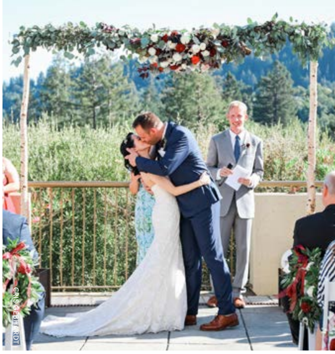
CNS GEDDI RDT